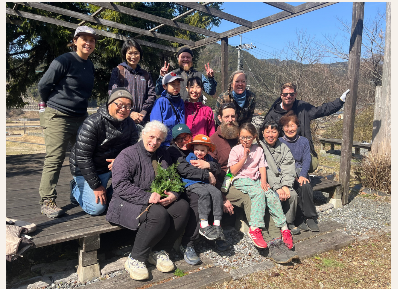
Nature walk & Dream Seeds Planting